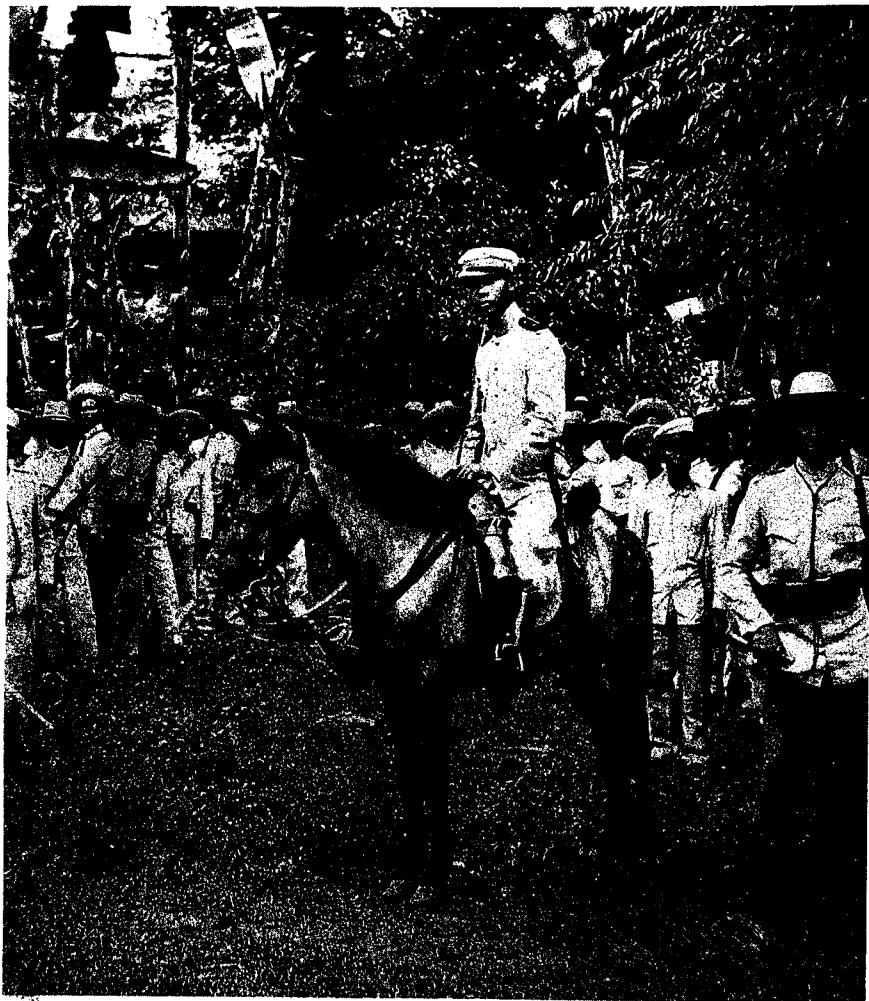
Generalissimo Don Emilio Aguinaldo y Famy, youthful leader of the Filipino nationalists, was repeatedly humiliated by the American military commanders. Six months after the United States occupied Manila, tense relations between the two armies broke into open warfare. After suffering initial defeats, Aguinaldo abandoned standard western battle tactics and adopted an effective policy of guerrilla warfare.

As the debate raged, Dewey continued to hold Manila Bay, and the Philippines seemed to await America’s pleasure. President McKinley would ultimately cast the deciding vote in determining America’s role in that country. McKinley, a genial, rather laid-back, former congressman from Ohio and one-time major in the Union army, remains a rather ambiguous figure during this pe-